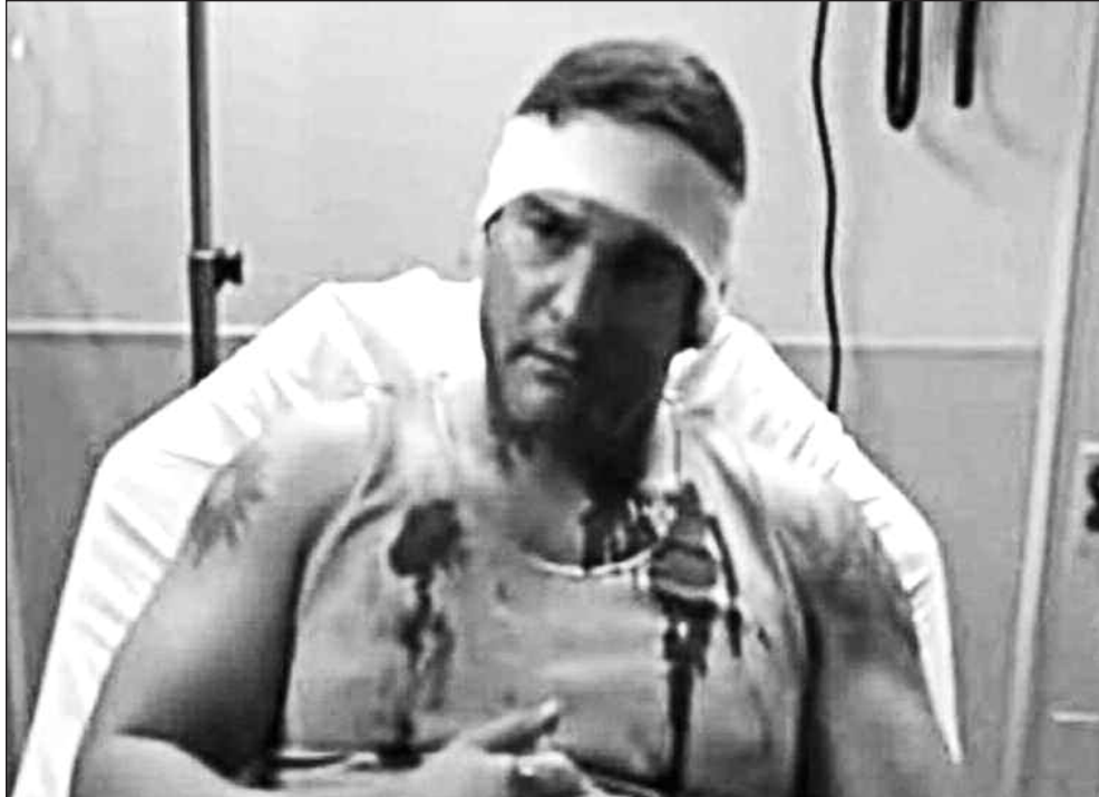
THE SMALL SCREEN – Jersey City actor George Pogatsia returned to the hit drama series Law and Order on Nov. 5. For more information please visit: http://www.imdb.com/name/nm1784765/ .

For more information about George Pogatsia and "The Pizza Tapes," visit: http://www.imdb.com/name/nm1784765/ . □